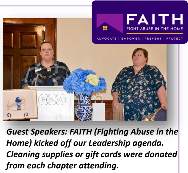
Guest Speakers: FAITH (Fighting Abuse in the Home) kicked off our Leadership agenda. Cleaning supplies or gift cards were donated from each chapter attending.