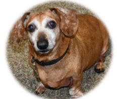
Max: 9/23/09 - 9/18/22