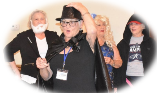
Bring in the "Clowns"