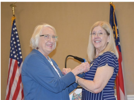
Georgia State Council Seventy-Six Convention Raising and Lowering of the Gavel