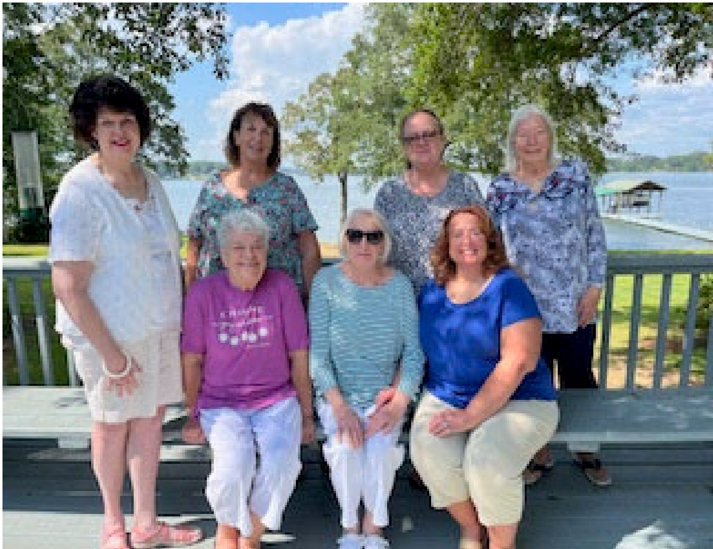
Executive Board Retreat - Logan Martin Lake, Talladega, AL