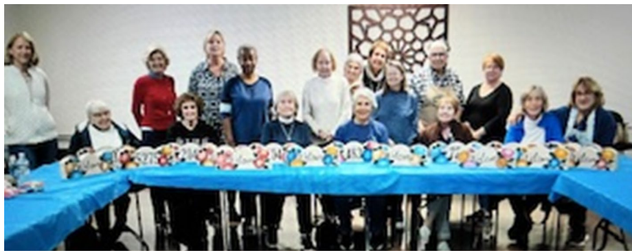
Gamma Omega Stone Painting, Aiken, SC