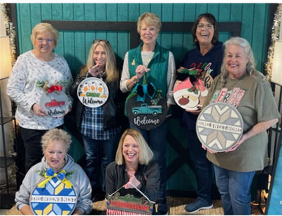
Alpha Delta made Door Hangers at the Teel Barn in Bremen, GA