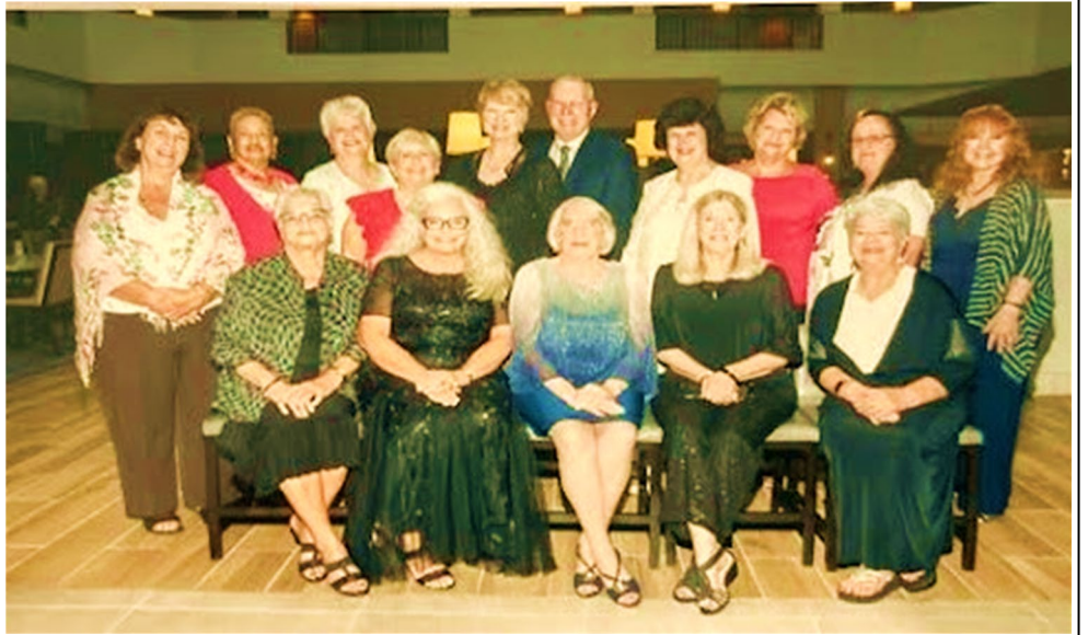
GSC Members 2025 ESA International Convention, Cary, NC