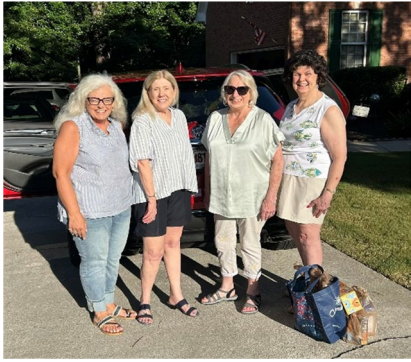
On our way to Cary, NC for IC Convention