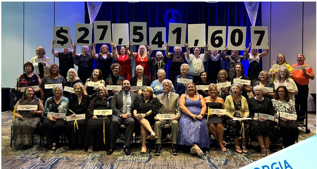
St Jude 2025 ESA International Donation