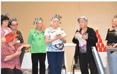
Georgia State Council Seventy-Six Convention MIXER PARTY - Officer Candidates