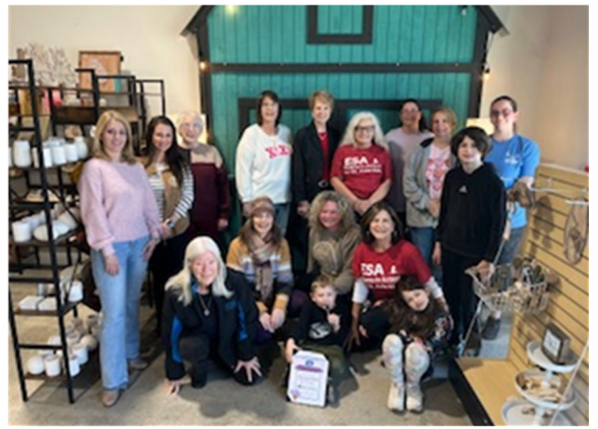
Alpha Beta Suncatchers for St. Jude, Teel Barn, Bremen, GA