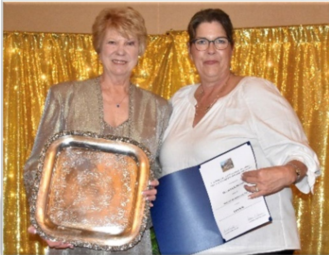
Chapter of the Year - Alpha Delta